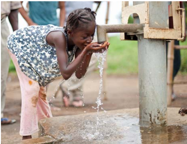
Safe drinking water helps children stay healthy!

Every year, Lifewater crews provide more than 80,000 men, women and children with clean water, sanitary toilets and life-saving knowledge about how to prevent sickness.